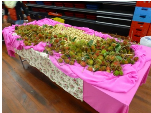
Figure4: langsung and rambutan