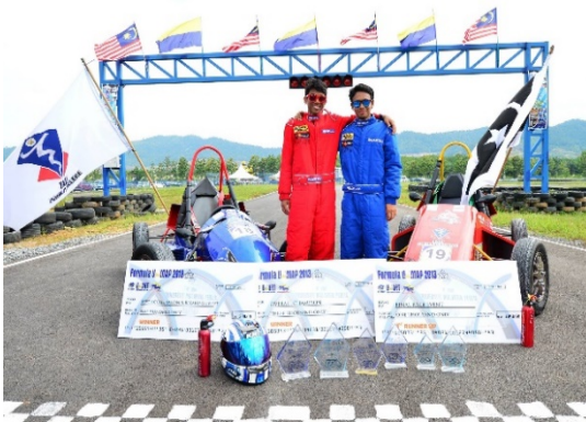
Figure5: drivers of TATI racing team