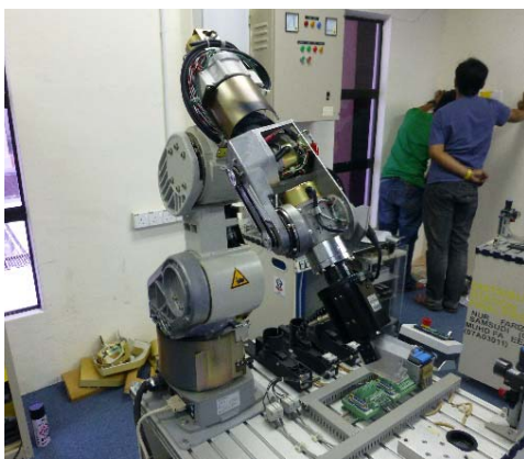
Figure1: outward appearance of robot arm

In the cluster room I took charge of the robot arm made in 1980s. This equipment had been already broken so I tried to deal with understanding the construction and mechanism with dismantling and reading the explanatory leaflet.