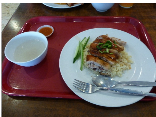
Figure11: chicken rice and soup

Most meals contain the spices Chile, ginger, zingiber and so on. Honestly, what is eaten for those who do not like spicy food is less. Staple food is rice, like Japan, but that one is less tenacious than Japanese one. We do not eat pork because it is Islamic. Beef and chicken was eating a variety of regions.