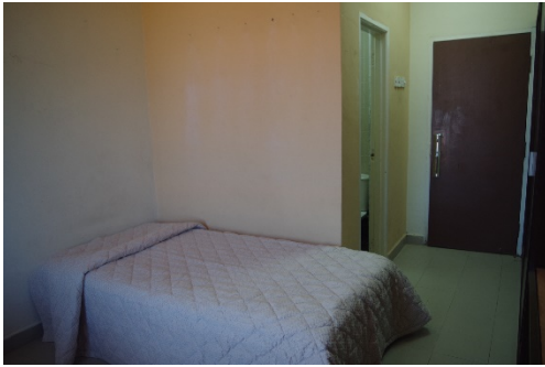
Figure13: with two single beds

Our all students had stayed at ITC Hotel that TATI University owns. All was single room basically. There were not amenities. I purchased them in the supermarket. And there is hot shower there. But in my friend's (TATI UC student's) dormitory, there is not hot shower. They always use only cold shower. I put a picture of the room below.