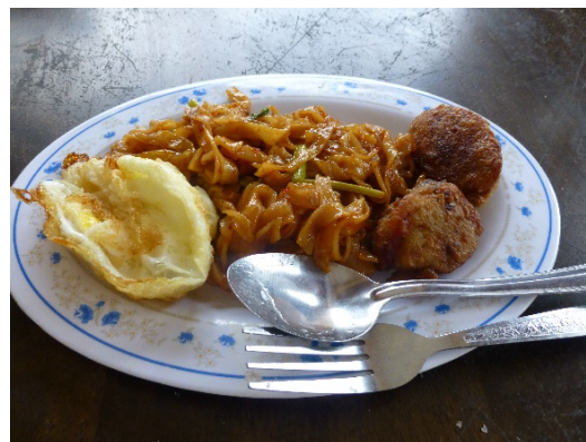
Figure12: fried noodle with garnishes