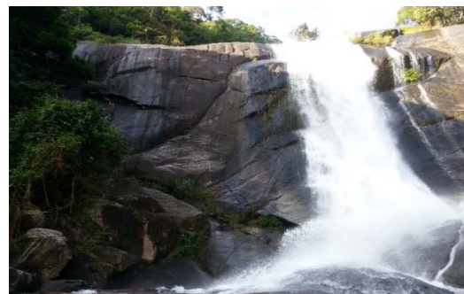
Figure8: waterfall in Lankawi