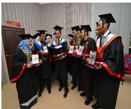
Figure9: a scene of convocation day

Convocation day is the day where all students received the scroll after completing the course of study. It took place like Japanese school festival in parallel and food stalls such as traditional food and snack, hamburger were crowded. Also, student performed some traditional music and dance and famous star play to the crowd on the special stage. We also took part in this performance as guest from Japan and sang two song “Kimigayo” and “Waninatte Odoorou”. We were acknowledged and had a wider circle of friends in the wake of that stage.