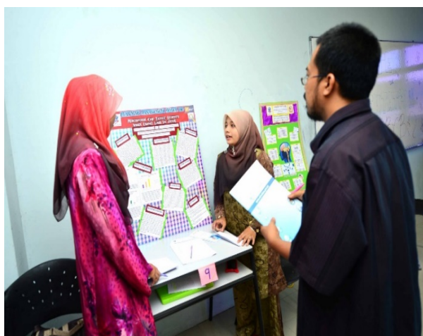
Figure10: women's clothes and men's one

Malaysian men's costumes are similar to Japanese one. However, when they pray, they must wear the formal clothes, for example with collar and quiet color. On the other hand, for women in Malaysia, exposure of the skin is prohibited because most of them are Muslimah. They look wearing something like Chinese dress and scarf at all times. Evidently, it seems to remove the scarf when they are with only women such as in dormitory.