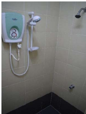
Figure15: shower available to hot water in prefabricated bath