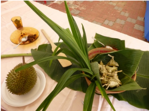
Figure3: durian and ketupat

The aid party was like a big celebration for the Muslim people who have been fasting for a month during Ramadhan month. They usually serve many traditional dishes like nasi minyak, nasi dagang, and so on together with cookies and sweets. After praying in the morning, they eat the food and receive the guests who visit our house. This day everyone wears the formal clothes.