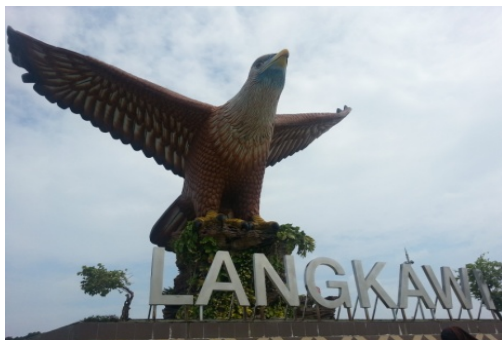
Figure7: symbol in Langkawi

I got the great opportunity that are going to famous tourist spot “Langkawi island” on the way of race. It was full of diversity of nature. There, tourists was able to try some sports such as snorkeling and kayak and so on. I could not try due to scheduling the time without warning. But I enjoyed driving many places.