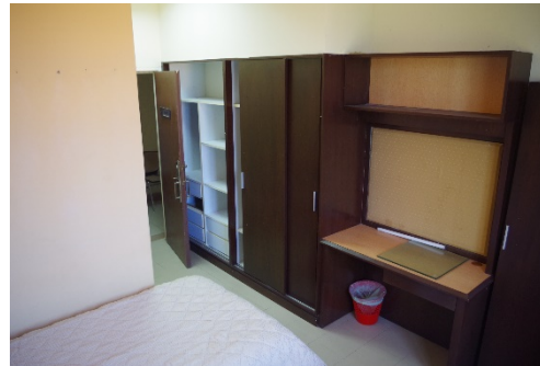
Figure14: shelf and desk