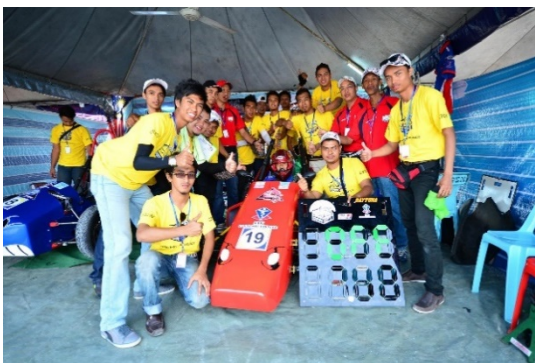
Figure6: members of TATI racing team

TATI UC took part in FORMULA UNIMAP that was car race. In this race, participants started to make car from the beginning and compete with each other about time. To participate this race, students belonging to department of manufacturing tried to design and produce, maintenance, and driving practice. In the case of design of car, the structure of car is designed to keep securing the safety, if collision and spin are occurred by any possibility. Moreover it is simulated how much power subjected during clashes with the software for analysis and also reduce the air resistance. In addition, they not only shaped the position of suspension to prevent from vibrations but also made steering more smoothly.