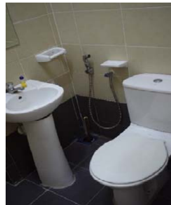
Figure16: flushing toilet and washstand in prefabricated bath